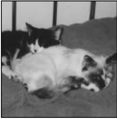
"Iris" and "Pearl"