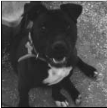
"Stitch" (a.k.a. "Reggie")